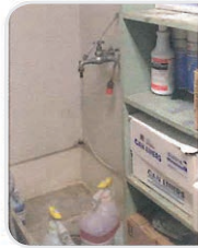
Cleaning Chemical Storage (Janitor's Closets)