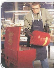
Industrial and Manufacturing Facilities

Look for areas where workers are using personal protective equipment such as goggles and liquid-proof gloves. These are found in areas where hazardous materials are being used and eyewashes and/or showers will be required as secondary protection.