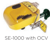
SE-1000 with OCV