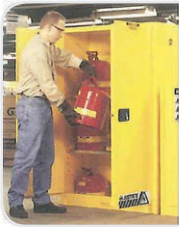
Chemical Storage Cabinets

The storage, transfer and use of flammable liquids require showers and/or eyewashes as secondary protection. Look for containers used to handle or store these materials and make sure ANSI/ISEA Z358.1 compliant emergency equipment is within 10 seconds' travel distance.