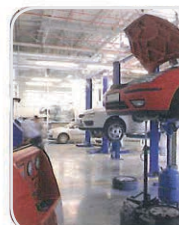
Automotive Service Shops