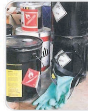
Bulk Chemical Storage