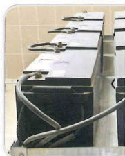
Industrial Battery Charging