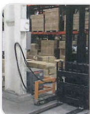
Fork Lift and Maintenance

OSHA Directive #STD 1-8.2 "provides guidelines regarding eyewash and body flushing facilities required for immediate emergency use in electric storage battery charging and maintenance areas." Make sure emergency equipment is properly located near these hazards.