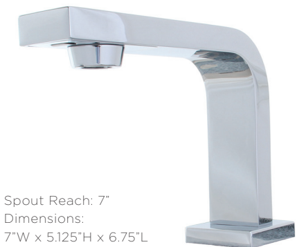
Spout Reach: 7" Dimensions: 7"W x 5.125"H x 6.75"L