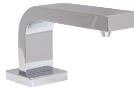
SFS-9000 Designer Sensor Soap Dispenser