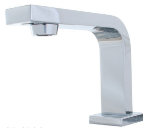
SF-9700 SF-9700-TMV Battery Powered Designer Series Sensor Faucet TMV = Thermostatic Mixing Valve