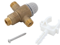
A-TMV UNDER COUNTER THERMOSTATIC MIXING VALVE

An industry best with low cost/high performance, our A-TMV Under Counter Thermostatic Mixing Valve is a compact thermostatic mixing valve for use with a variety of faucet installations. A-TMV regulates outlet temperature of water to ensure safe & tepid water is delivered to the user. A-TMV has a compact footprint that allows for easier installations under counter with 3/8" compression male threaded inlets & outlet.