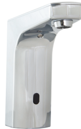
SF-8700 SF-8700-TMV Battery Powered Sensor Faucet TMV = Thermostatic Mixing Valve