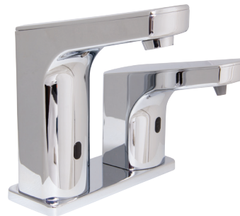
SFC-8790 Low Arc Sensor Faucet and Soap Combination