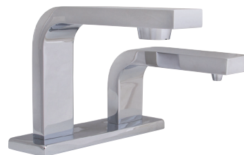
SFC-9790 Designer Series Sensor Faucet and Soap Combination