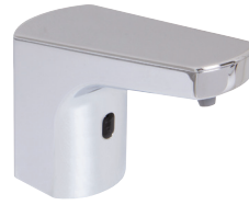
SFS-8000 Classic Sensor Soap Dispenser